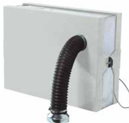
Downstream HEPA filter