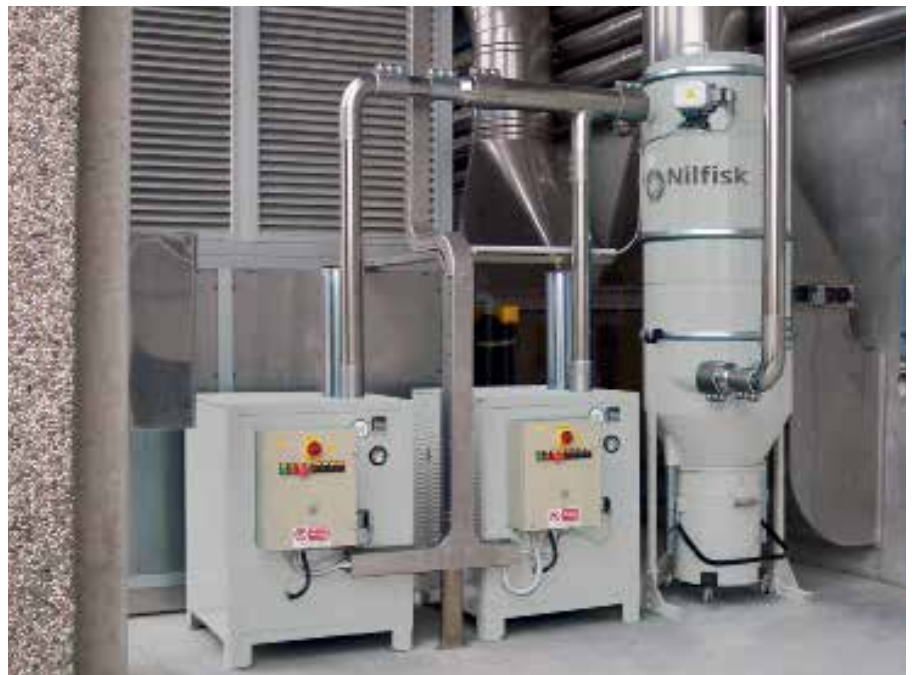
Centralized vacuum system in a chemical company: 2 vacuum units, 1 filter silo.

Centralized vacuum systems are the ideal solution for vacuum applications required in several places simultaneously, and in large environments that may have very different features. ATEX certified systems are often the only choice for large industrial production.