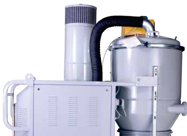
Air outlet diffuser