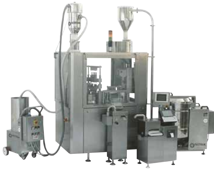
Pneumatic conveyor (left) and capsule pusher (right), in a pharmaceutical company.

Pneumatic conveyors are designed to transport powders and granules from one point to another without changing the mix. These systems are often used to feed automatic machines. The ATEX versions abide by the safety standards used in food production and the chemical-pharmaceutical industry.