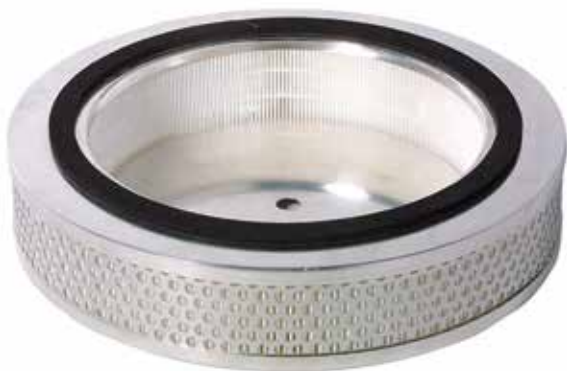
Upstream absolute filter

Visit the site www.nilfisk.com for a free accessories catalogue, including optionals and separators for your vacuum: you'll find the perfect solution to meet your own specific requirements.