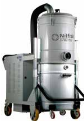
7.5 kW three-phase up to 18.5