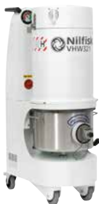
Three-phase up to 4 kW