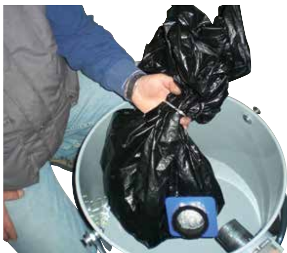
Safe Bag filter