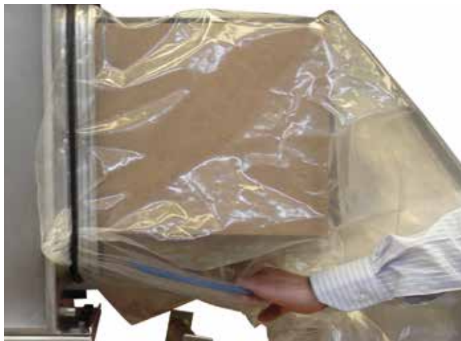
Bag-In Bag-Out filter system