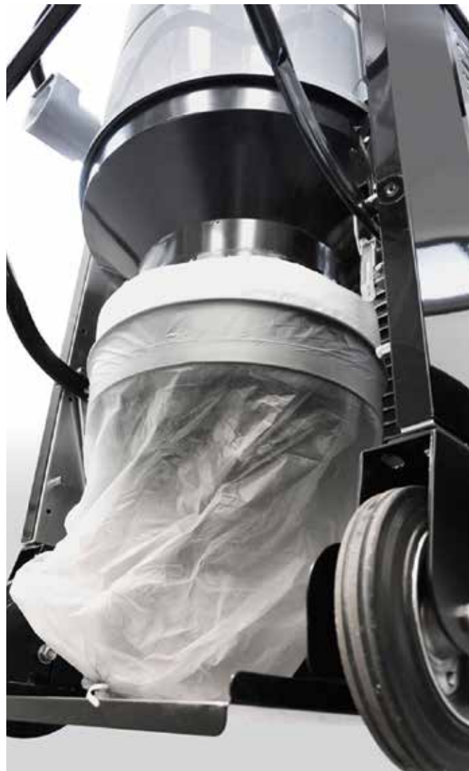
Longopac® "endless" collection system

For more information send an e-mail to industrial-vacuum@nilfisk.com or visit our website www.nilfisk.com .